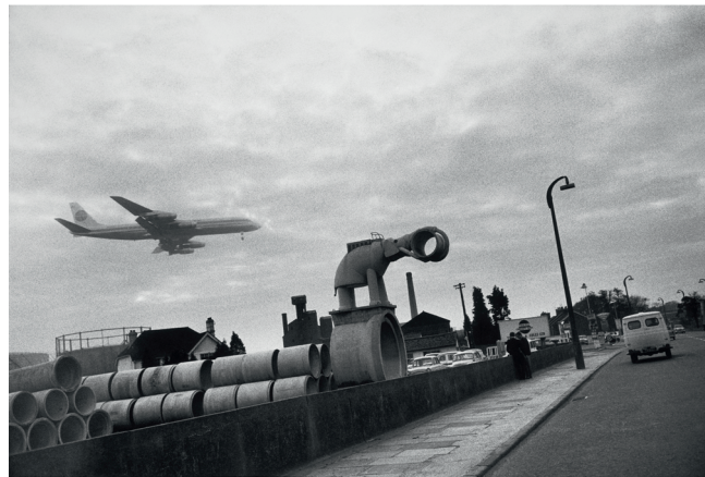
London, England, 1966