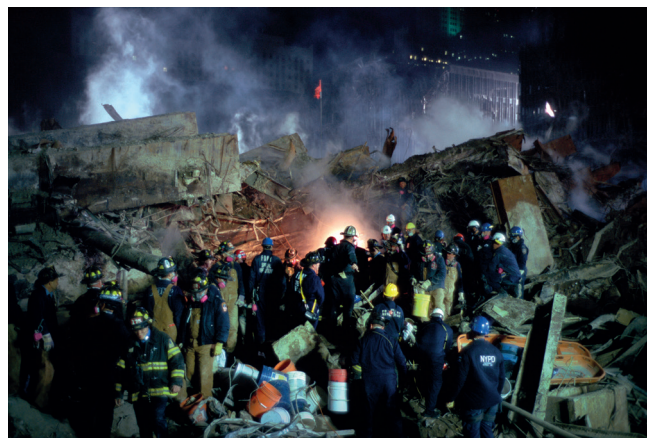
Five more found, New York City, 2001