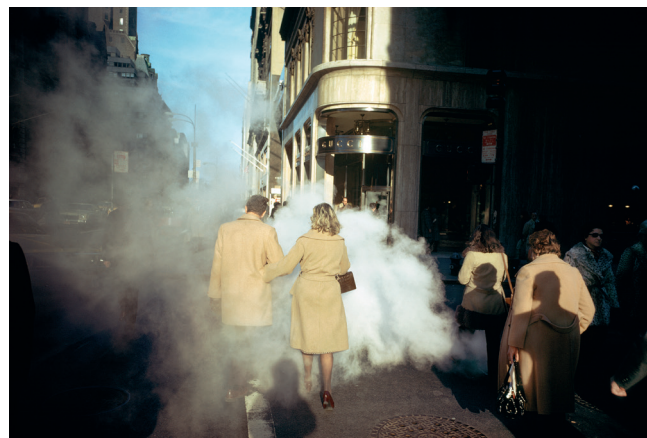
New York City, 1975