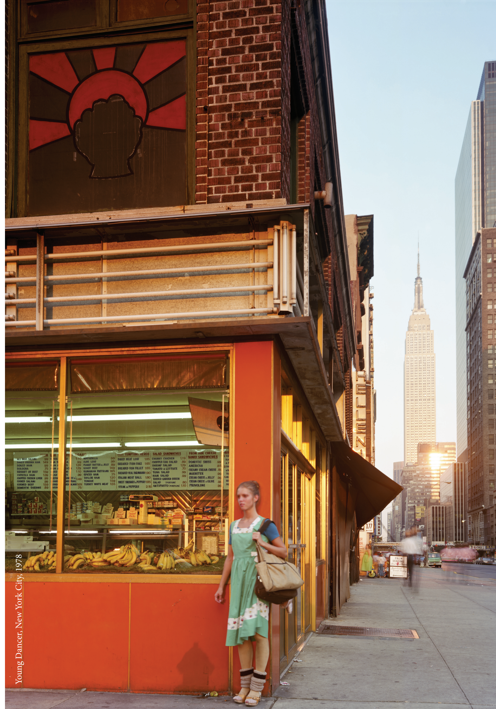
Young Dancer, New York City, 1978