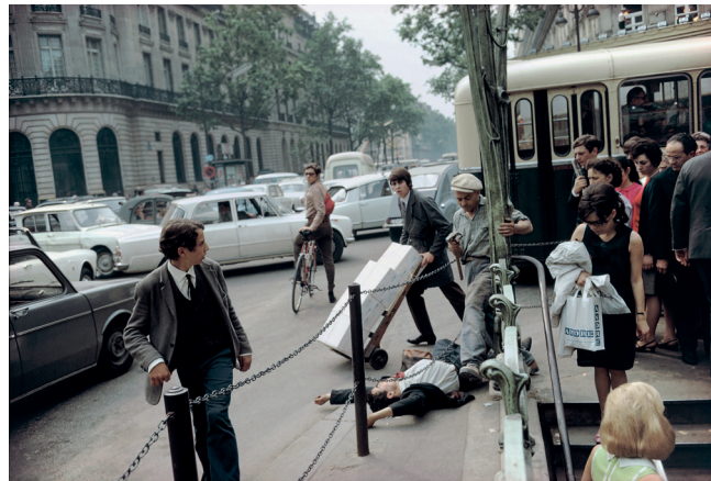
Paris, France, 1967