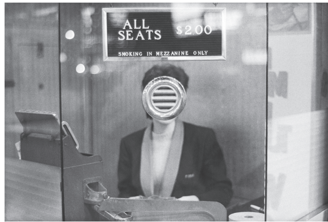
New York City, 1963