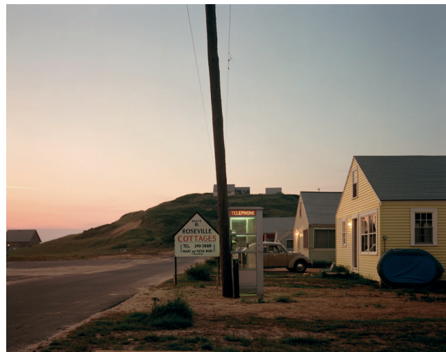
Roseville Cottages, Truro, Massachusetts, 1976